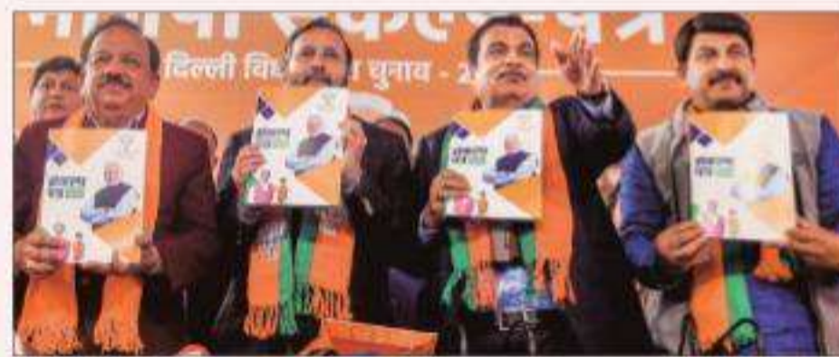
Union ministers and BJP leaders Nitin Gadkari, Prakash Javadekar and Harsh Vardhan along with Delhi BJP President Manoj Tiwari release the BJP Sankalp Patra in New Delhi on Friday

PRESS TRUST OF INDIA New Delhi, January 31